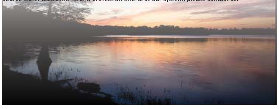
Harris County Municipal Utility District No. 102

Our drinking water is obtained from groundwater and surface water sources. Our water comes from the Evangeline and Chicot aguifers and the Trinity River via the West Harris Regional Water Authority which purchases water from the City of Houston. A Source Water Susceptibility Assessment for your drinking water sources is currently being updated by the Texas Commison on Environmental Quality and will be provided to us this year. This information describes the susceptibility and types of constituents that may come into contact with your drinking water source based on human activities and natural conditions. The information contained in the assessment will allow us to focus our source water protections strategies. Some of this source water assessment information will be available later this year on Texas Drinking Water Watch at http://dww.tceq.texas.gov/DWW/. For more information on source water assessments and protection efforts at our system, please contact us.